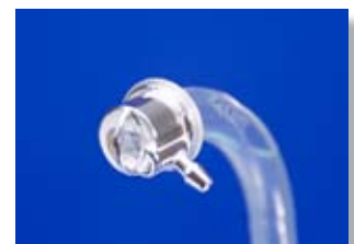
FreeVent speech valve with O 2 connection