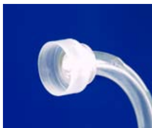
Inner cannula with HME connector