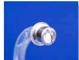
FreeVent speech valve