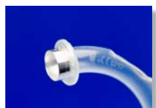
Example: Extra inner cannula AD in PUR

All FreeVent spare parts and inner cannulas can be ordered separately i.e all connectors in both PUR or Silver material can be ordered. Contact your local dealer for more information.