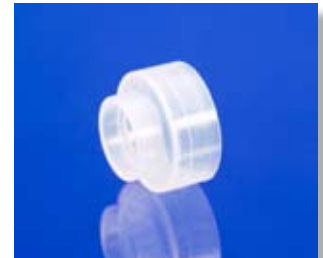
HME adapter for PUR and Silver