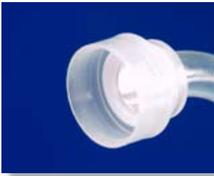
22 mm HME connector